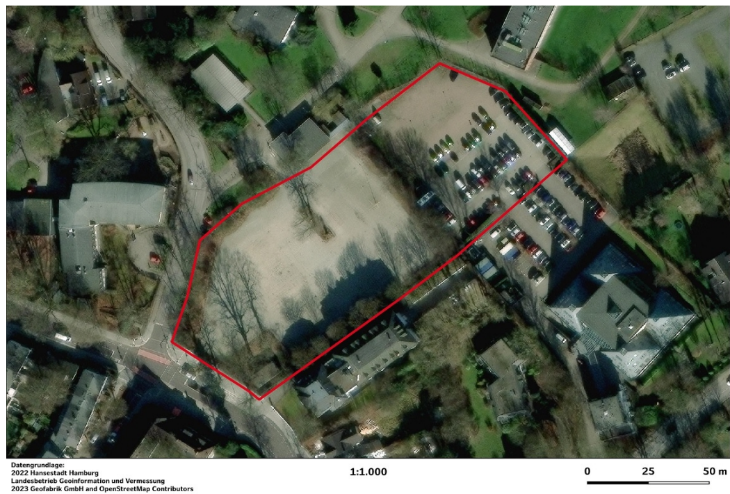
aerial view 1 to 1000