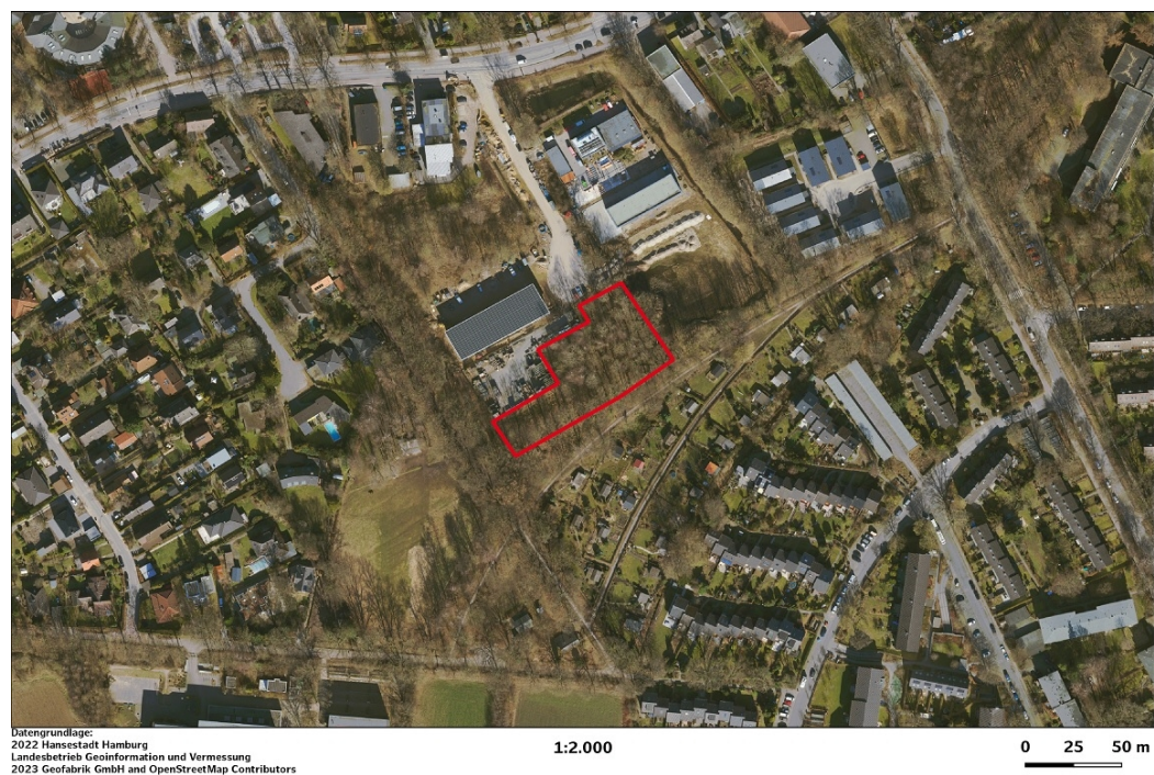
aerial view 1 to 2000