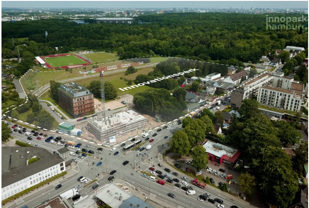
view of Altona Innovation Park