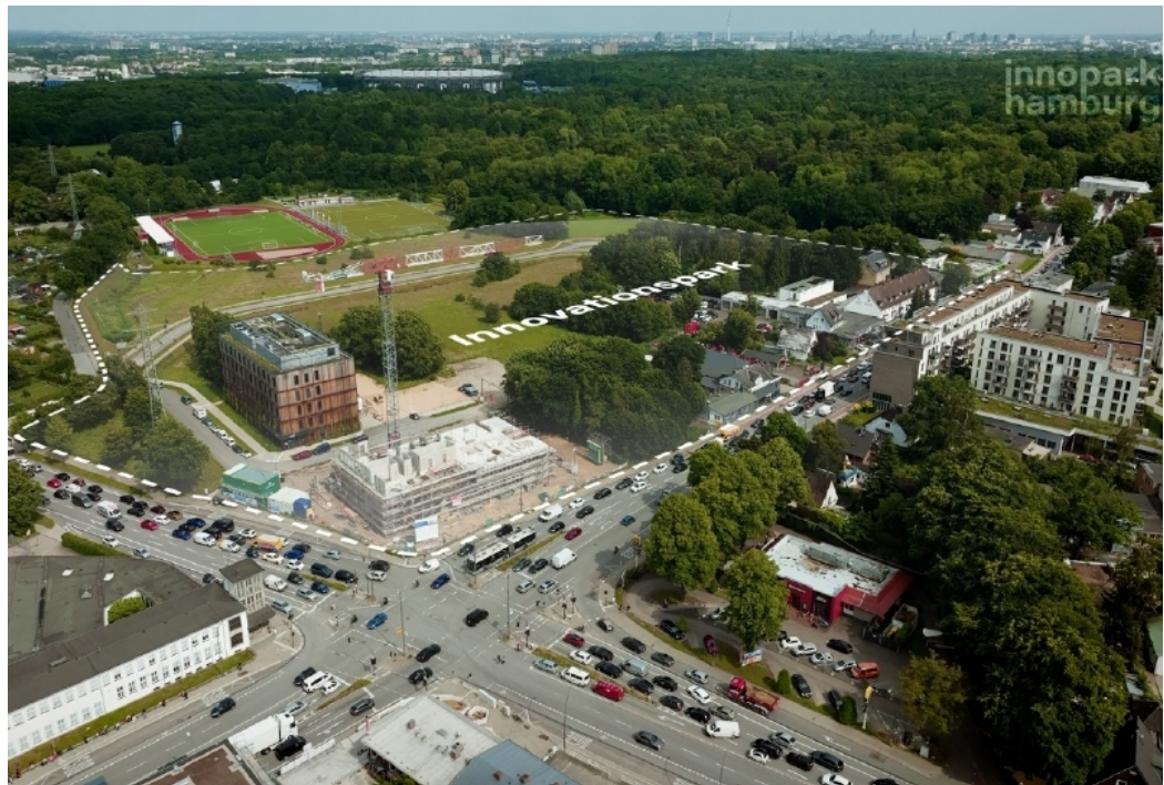
Ansicht Innovationspark Altona